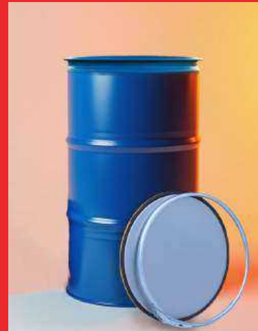
Goose Neck/ Optima Barrels