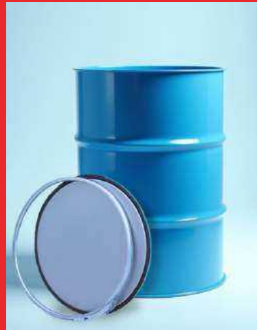
Open Top Drums