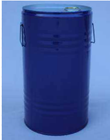
Close Top Drums