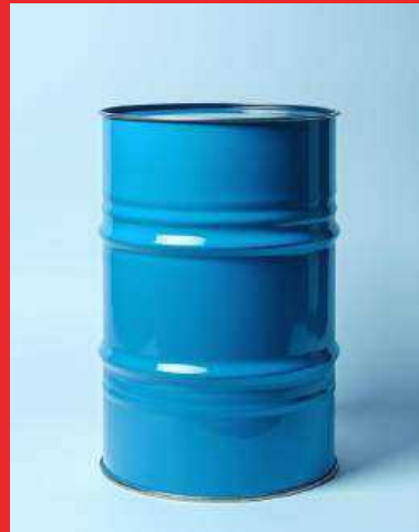
Close Top Drums

We have a wide variety of products for all your industrial packaging needs