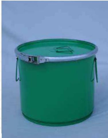
Open Top Drums